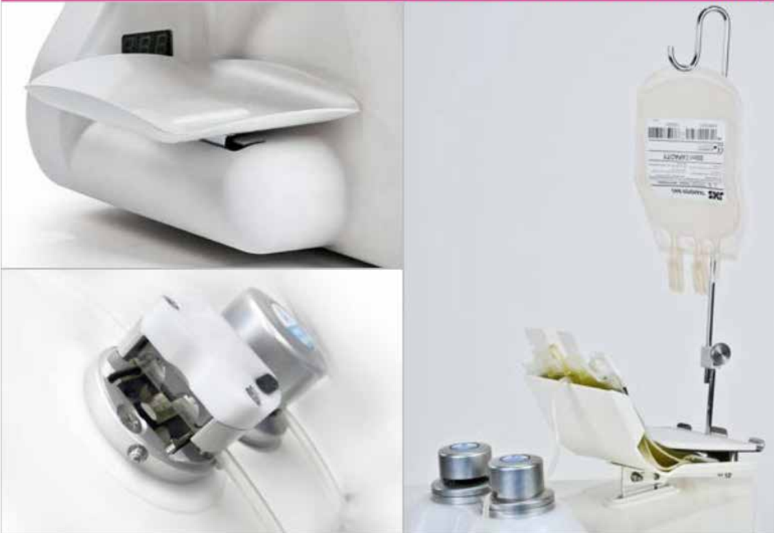
Self adjustable clamps for all types of blood bag tubes